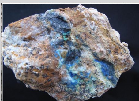
BONITA PROJECT, NV Jurassic Copper-Gold alkalic porphyry