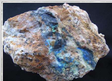
BONITA PROJECT, NV Jurassic Copper-Gold alkalic porphyry