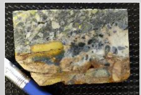
AMSEL PROJECT, NV Tertiary Epithermal Au-Ag in tuffisite breccia