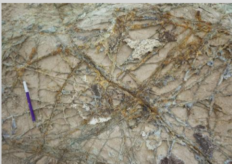
NEW BOSTON PROJECT, NV Cretaceous Mo-W-Cu-Ag porphyry