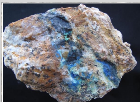
BONITA PROJECT, NV Jurassic Copper-Gold alkalic porphyry